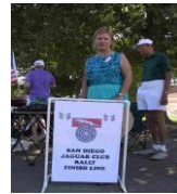
INTRODUCING THE FIRM OF RUMMEL, BRADLEY AND TOWNSEND