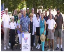
RALLY CREWS, CHECKPOINT TEAMS AND ORGANIZERS POSE PRIOR TO PICNIC