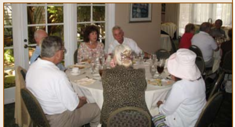
Dining at the Country Club