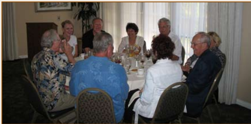
Enjoying an excellent lunch