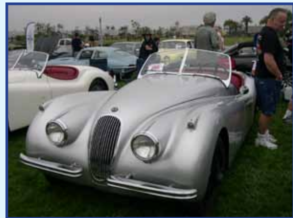
Joe Harding's 1954 XK120 with special bronze racing knock-off hubs