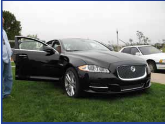
The Rummell's brand new 2001 XJ