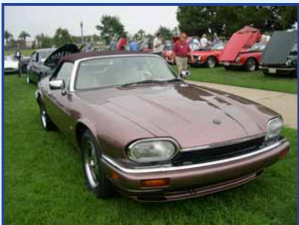
Vic Change's Rose Bronze 1995 XJ-S convertible parked in front of a row of Triumphs