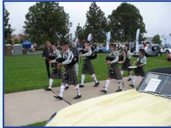
What would British Car Day be without the Cameron Highlanders Pipe Band of San Diego County?

The new venue worked out very well with shopping nearby and eateries in the area to suit everyone's taste and budget. The weather was typically British overcast, then turned to bright sun in the afternoon.