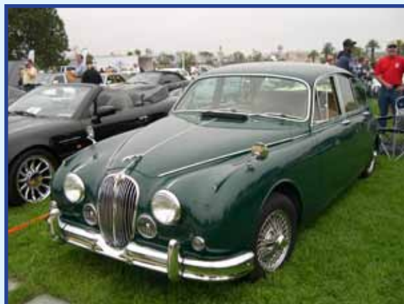
Tim and Sandi Woodard's beautiful MK 2