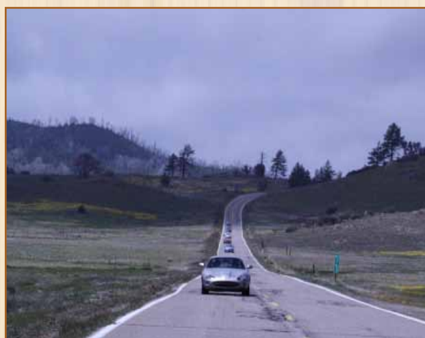
A long line of Jaguars