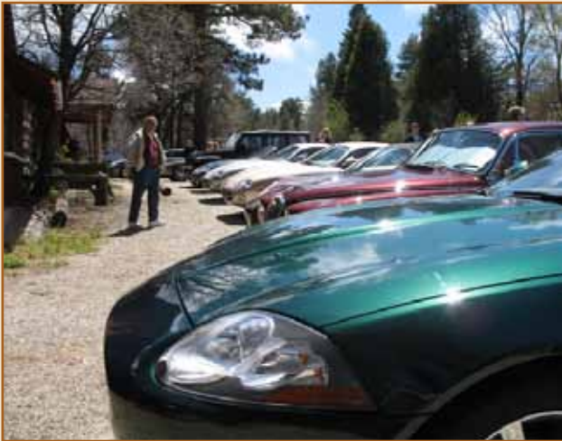
Lined up in front of The Eagle and the Bear