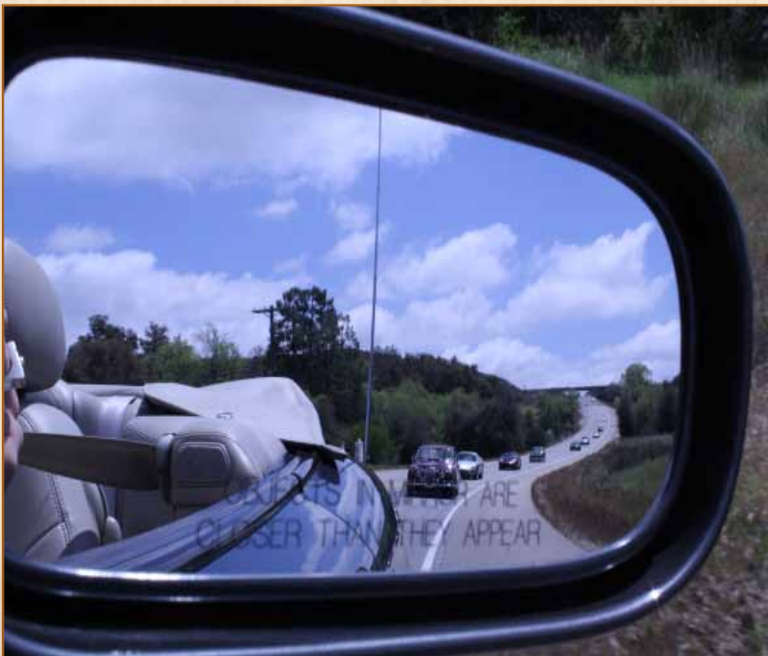
On the way to the restaurant