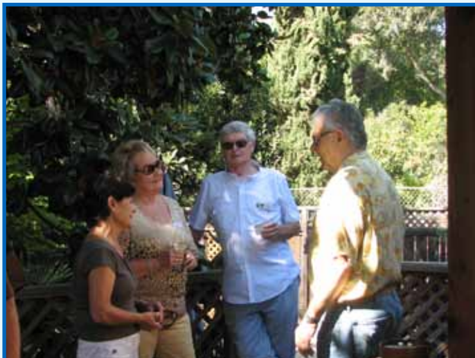
The Rummells and Cohens socialize