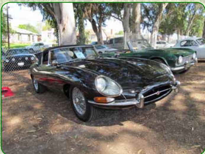
Craig Venter's 1963 E-Type OTS