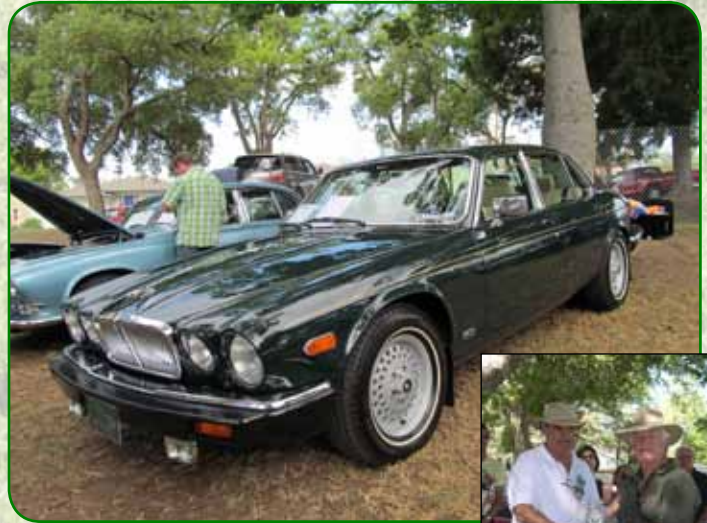
Paul Novak's 1990 V12 VDP