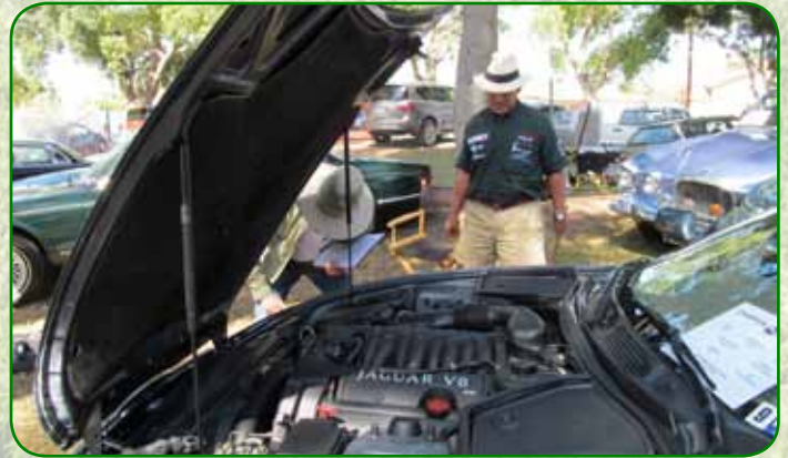
My engine compartment being carefully judged