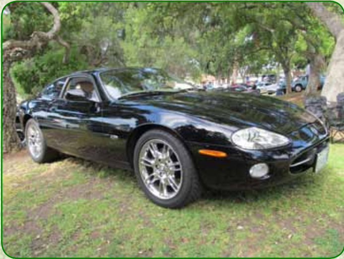
Debbie Woolley displayed her 2002 XK8 Coupe