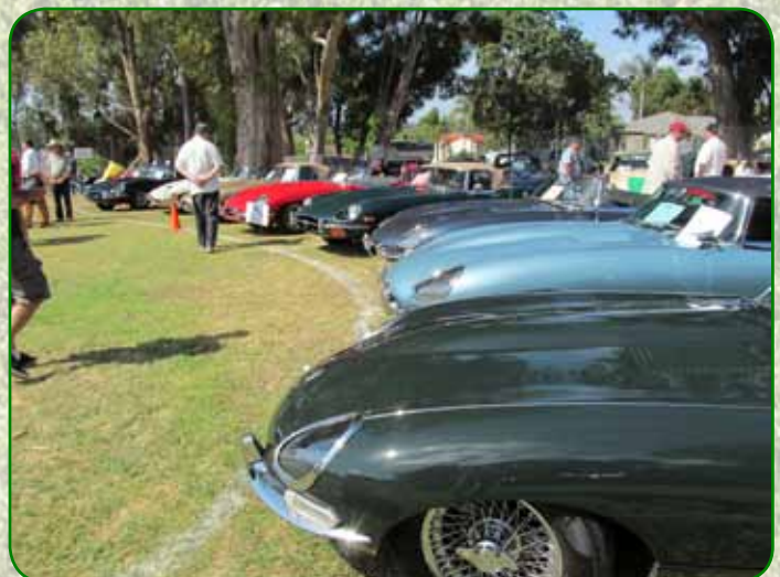
Obligatory artsy shot