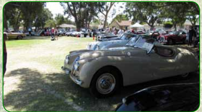
Line of XKs

Because this is an SDJC newsletter, I only included photos and standing of our own member's Jags. I wish I could have included all the Jags on the field. There were some spectacular examples on display!