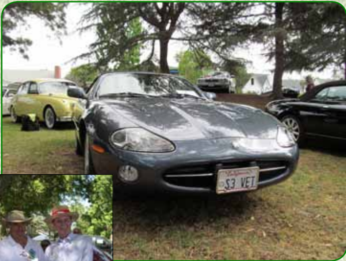
Me and my 2001 XK8