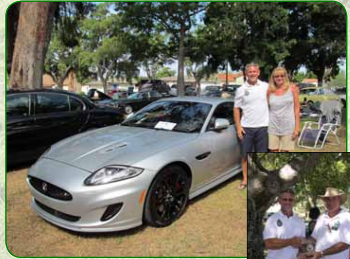
The Cohens with their 2012 XKR