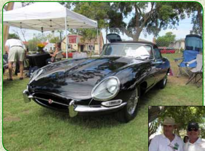
Stan Elman's 1963 E-Type OTS