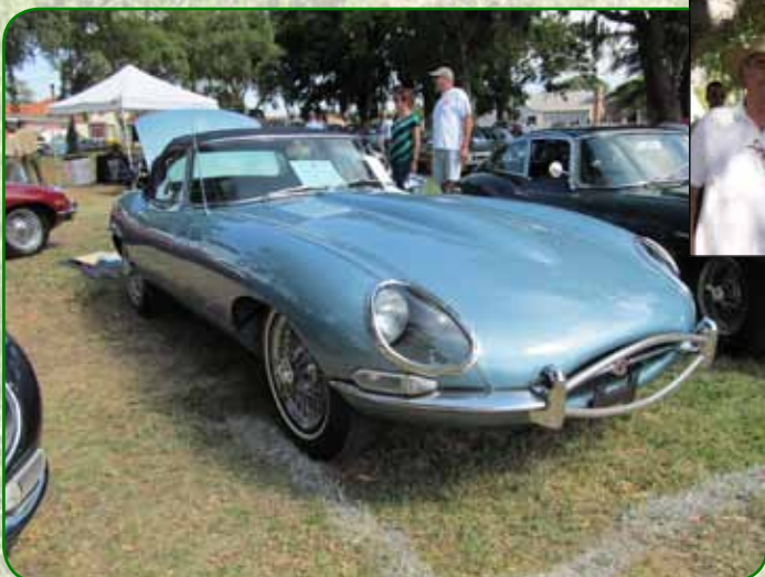
Tom Krefetz's Preservation Class 1963 E-Type