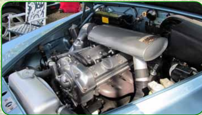
Tom's 420 engine compartment