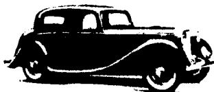
1½-litre S.S. Jaguar (1935-37)