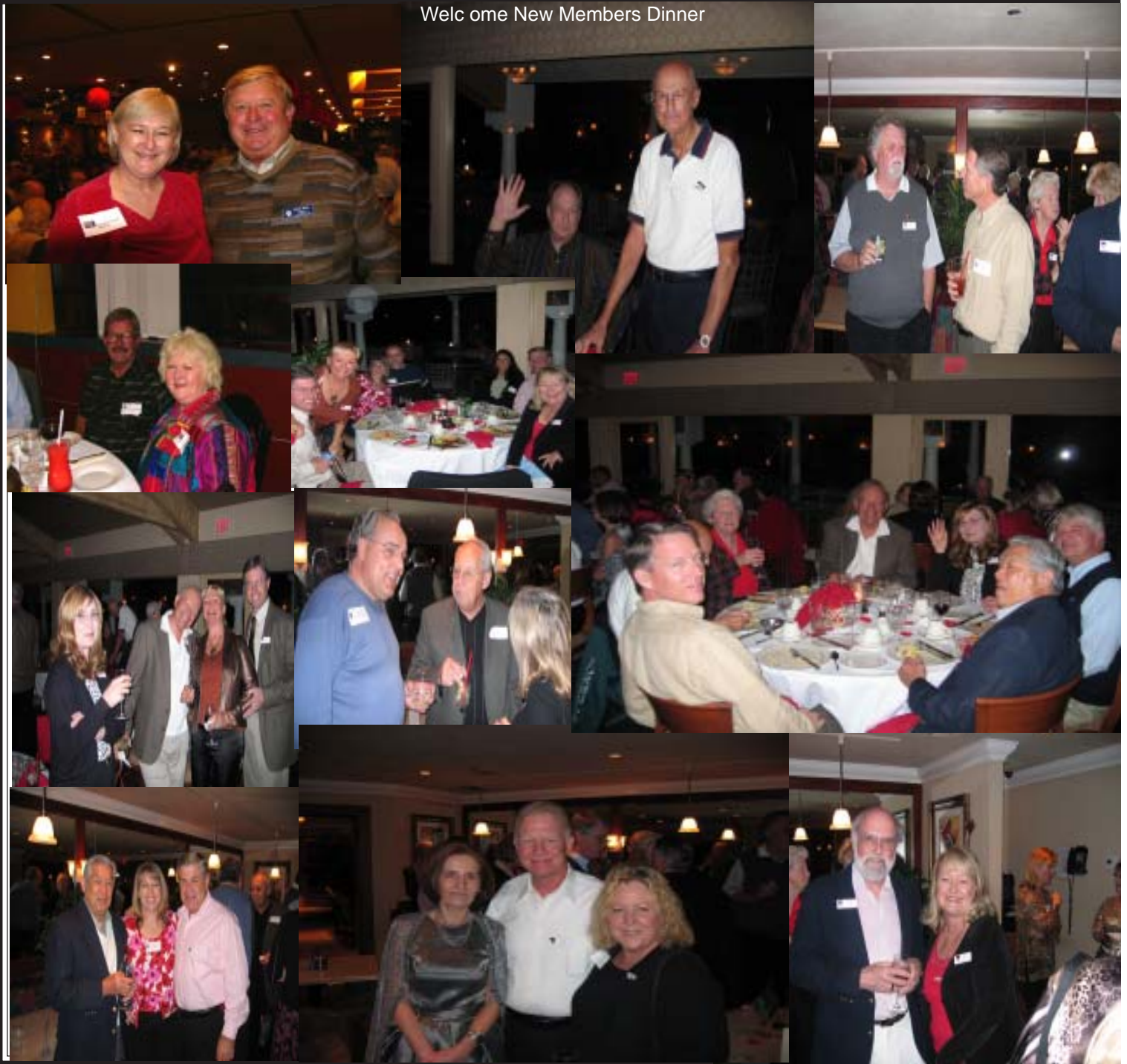
Welcome New Members Dinner